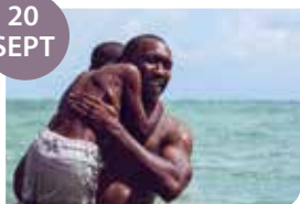
USA, 2016, Barry Jenkins Drama, 111 mins (15)