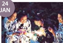
Japan, 2015, Hirokazu Kore-eda Comedy/Drama, 128 mins (PG)