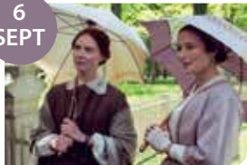
UK/Belgium, 2016, Terence Davies Biography/Drama, 125 mins (12A)