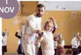
Fin/Est/Ger, 2015, Klaus Härö Drama/History/Sport, 99 mins (PG)