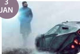
USA/UK/Can, 2017, Denis Villeneuve Sci-Fi/Thriller. Length and cert tbc