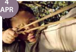
Italy/France, 2016, Gianfranco Rosi Documentary, 114 mins (12A)