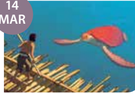
Fra/Bel/Jap, 2016, M. Dudok de Wit. Animation/Fantasy, 80 mins (PG)