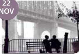
USA, 1979, Woody Allen. Comedy/ Drama/Romance, 96 mins (15)