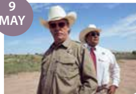
USA, 2016, David Mackenzie Crime/Drama/Thriller, 102 mins (15)